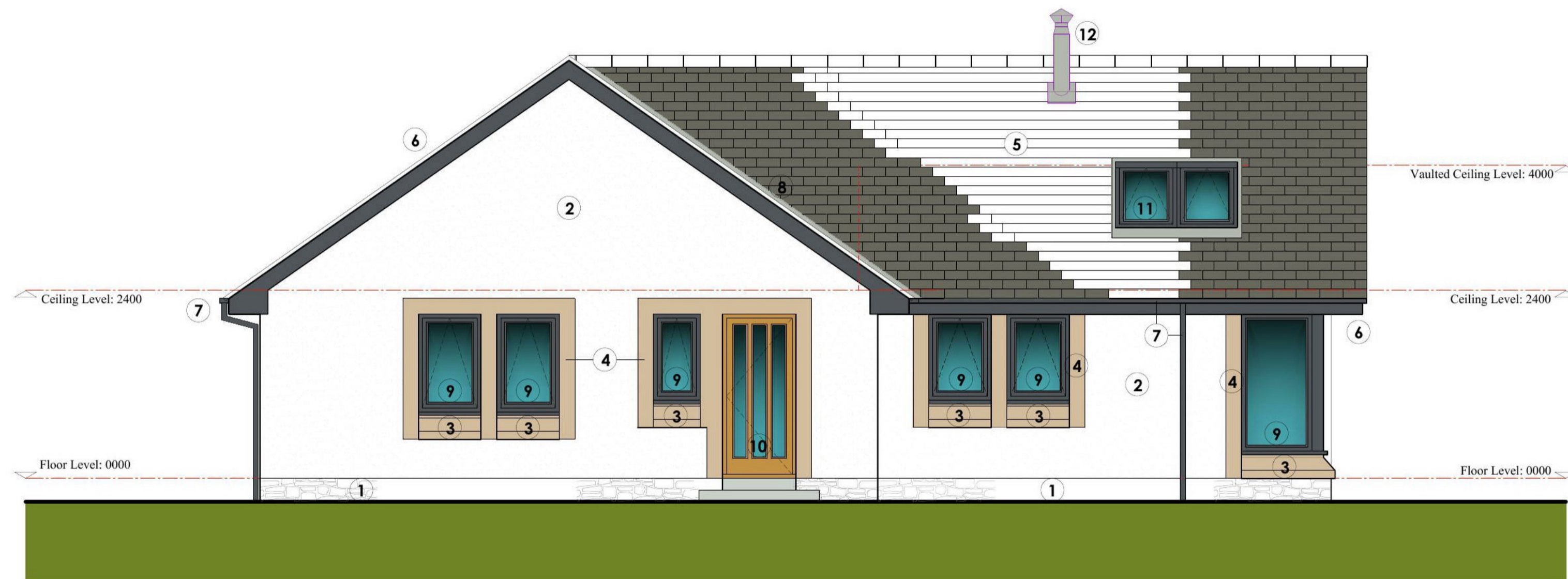
SOUTH Elevation SIDE Scale : 1 : 50.