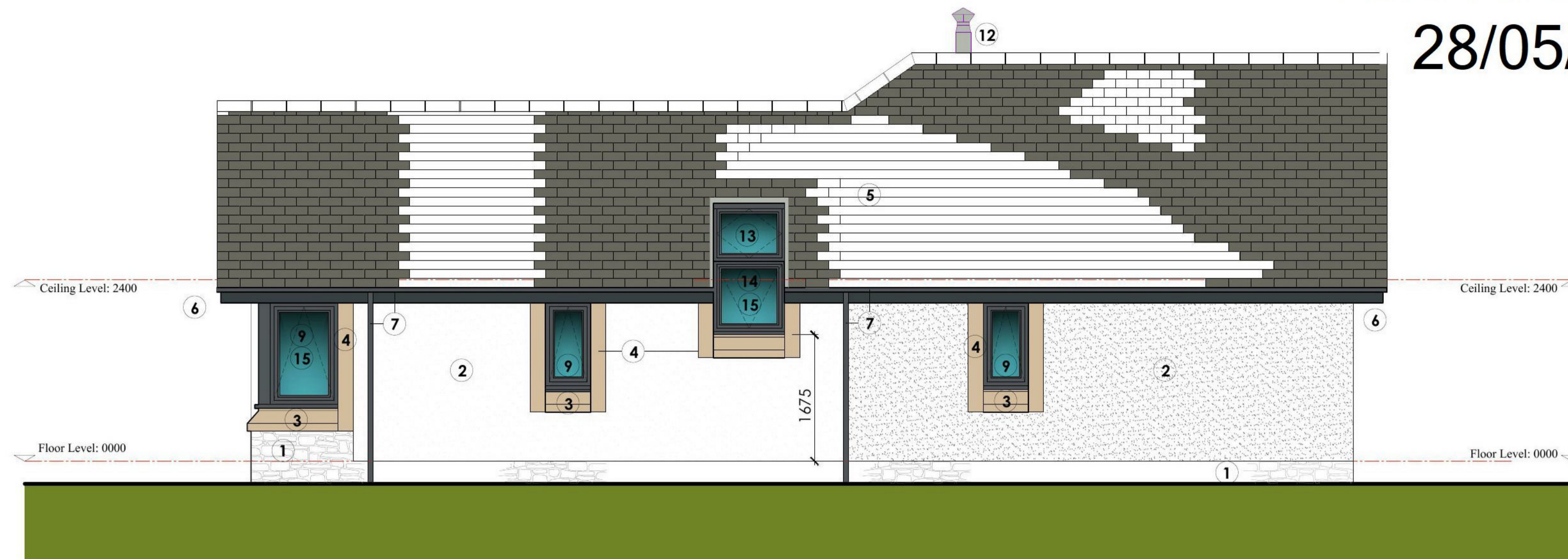
WEST Elevation REAR Scale : 1 : 50.